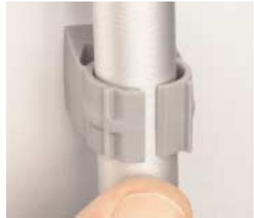
Press down on pipe to lock it firmly in place.