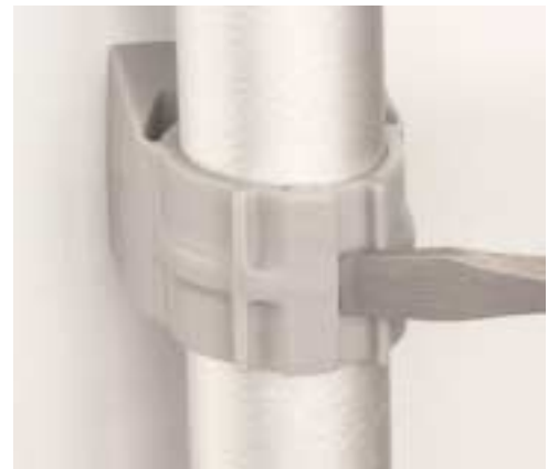
Removable. Use a screwdriver to lift tab.