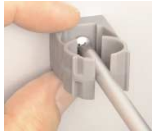
Mount to surface with a screw.