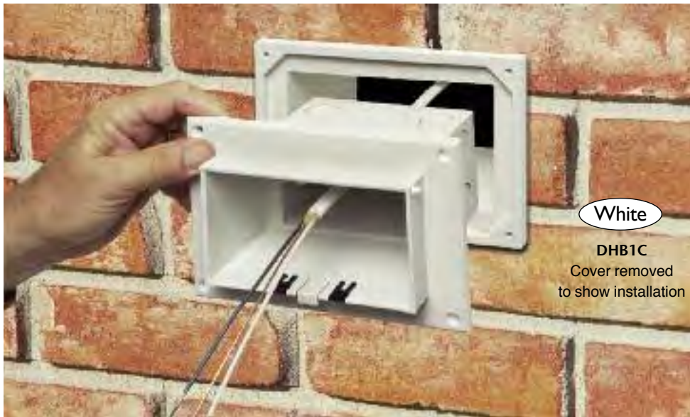
White DHB1C Cover removed to show installation