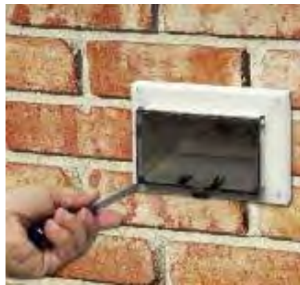
4 Attach IN BOX with the screws provided. Install wiring device per manufacturer's instructions.