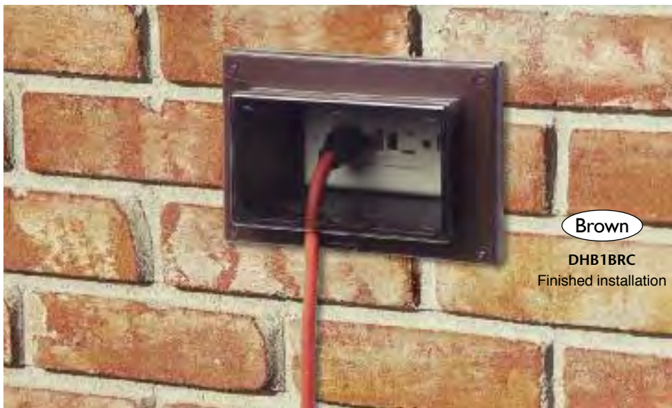
Brown DHB1BRC Finished installation