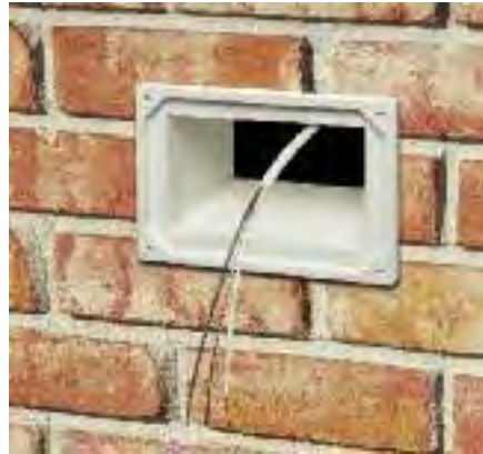
1 Mortar in adapter sleeve. Pull wire and tie off to loop in adapter sleeve.