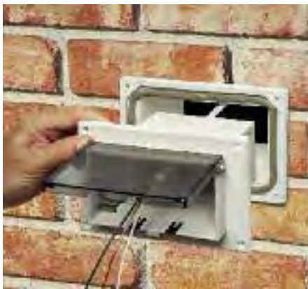
3 Install the supplied NM cable connector and wire. Insert the clean IN BOX into the adapter sleeve.