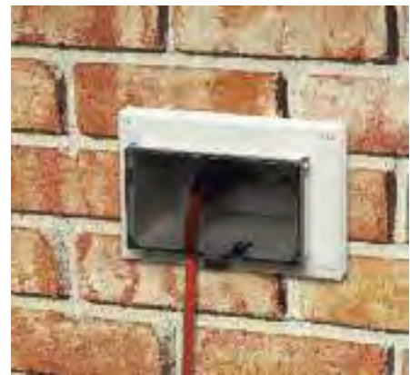
5 Install wiring device. IN BOX accepts most single gang wiring devices and uses a standard indoor wall plate. Plug in a cord for a weatherproof-while-in-use finished installation.