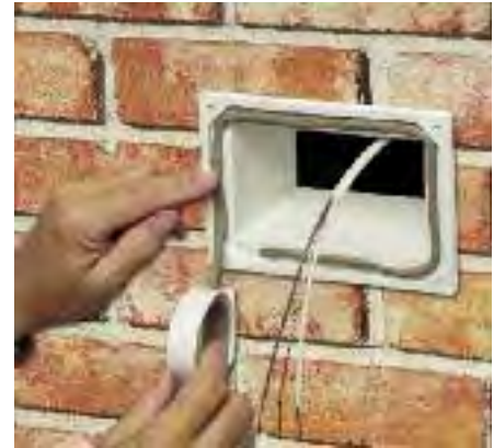
2 When ready to complete...apply supplied caulk as shown and press around edges of adapter sleeve.