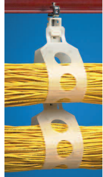
MULTIPLE LOOP HANGERS Stacked, parallel mounting